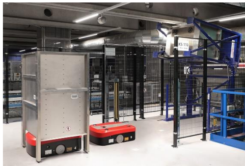
Grenzebach AGVs are ideal for restricted room heights.