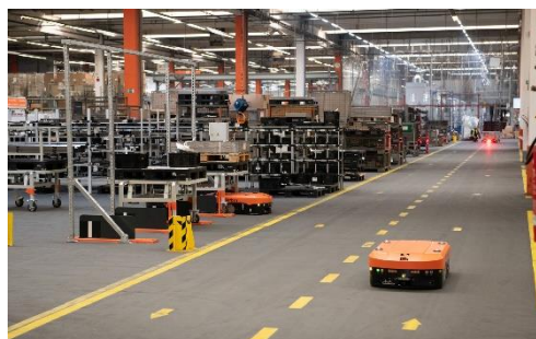
The Grenzebach AGVs offer a high degree of independence for König + Neurath.