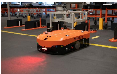
The system is designed to expand in line with future requirements without immediately reaching its limits.