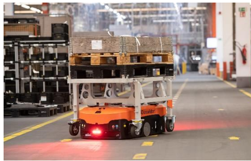
The AGVs transport around 1,000 good carriers per week.