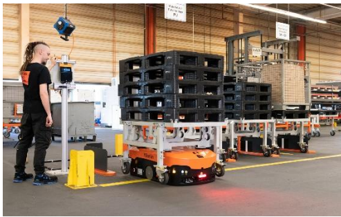
König + Neurath can commission and adapt the system themselves.