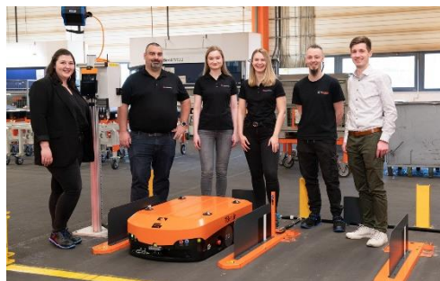
The project team of Grenzebach and König + Neurath.